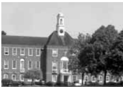
From top: Kelly College; Taunton School; St Swithuns