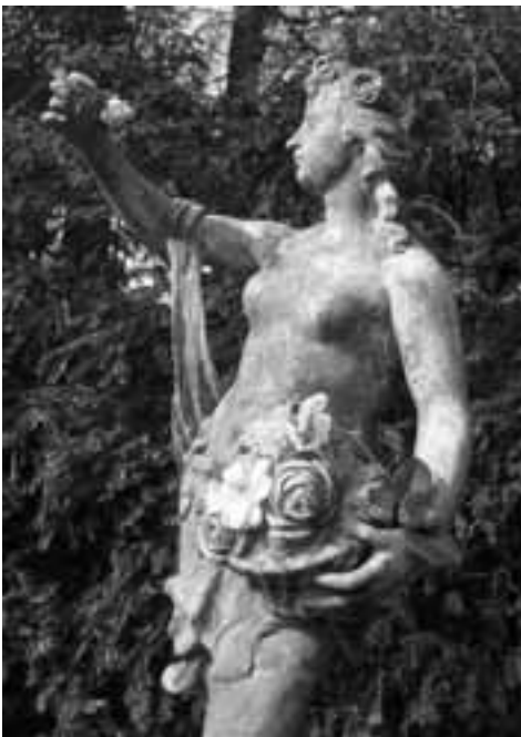
Clockwise from above: the statue of Flora; the summerhouse; sculpture in the gardens.