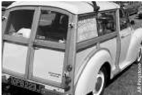
The Morris Traveller

The Morris Minor was produced in Britain until 1971, when cheaper and less memorable cars came into production. Despite no Minors having been produced for 37 years, there are still up to 40,000 of them on Britain's roads alone - and thousands more in countries all round the world.